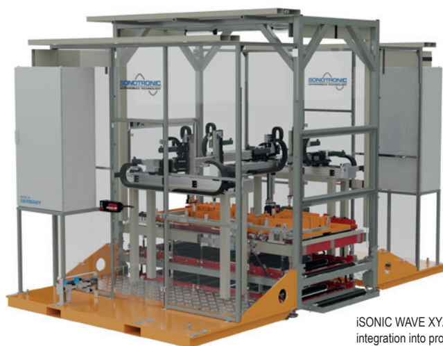
iSONIC WAVE XYZ integration into production lines